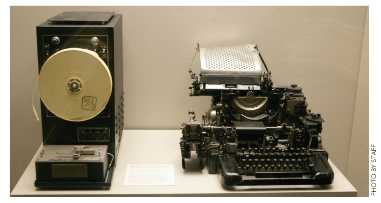
Components of the original hotline—the cryptography unit and teletypewriter—currently on display are on loan from the National Cryptologic Museum (Fort Meade, Maryland).