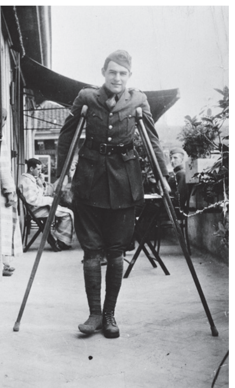
Ernest Hemingway recovering from a war injury in Milan, Italy, September 1918.