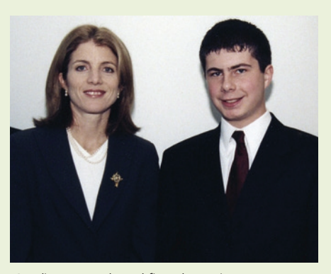
Caroline Kennedy and first-place winner Pete Buttigieg at the 2000 Profile in Courage Award Ceremony.

In 2012, at age 29, he was elected mayor of South Bend where he has launched cuttingedge initiatives which have addressed a variety of concerns, including transparency in government, housing, and economic development. Buttigieg also serves as a lieutenant in the US Navy Reserve and